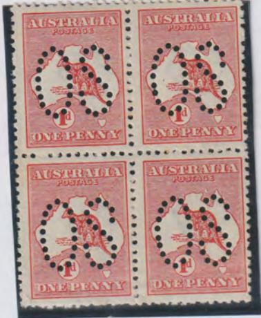
First watermark: Large OS