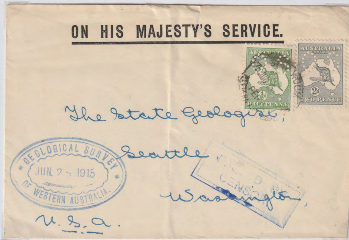
Geological Survey oval cachet 25 June 1915, Ship Room Perth 25 June, censor cachet