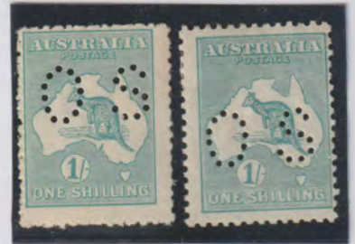
Fifth watermark: Small OS