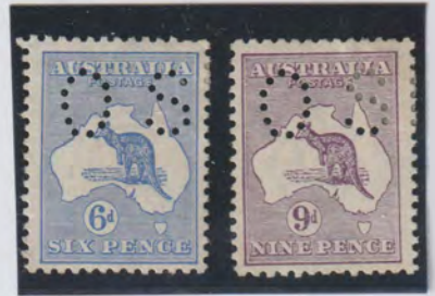
Third watermark: Small OS