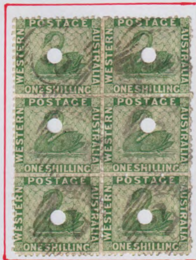
Largest recorded block of Imperial puncture stamps