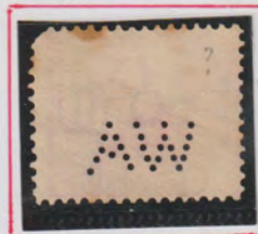
Long Leg A

Pocock's identification neatly explains the differences found in the perforation on these stamps with the exception of the 'long leg A' shown below. No satisfactory explanation is currently available for this variety.