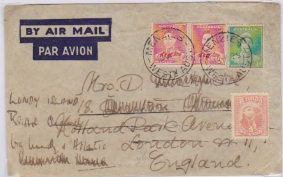
Menzies 18 June 1939, redirected to Lundy