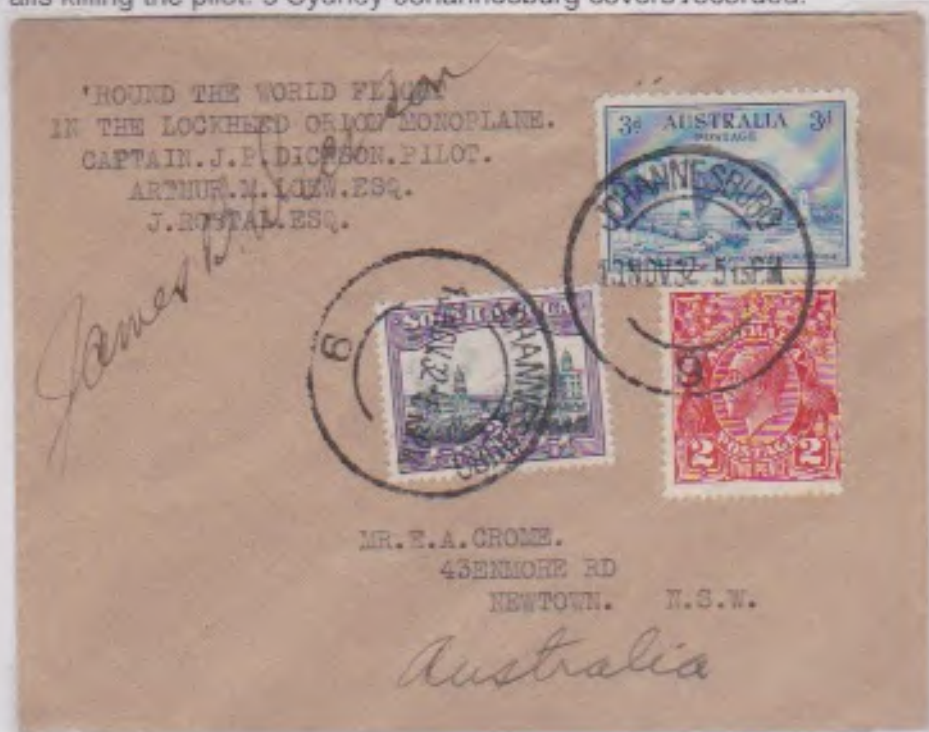
Johannesburg 13 November 1932