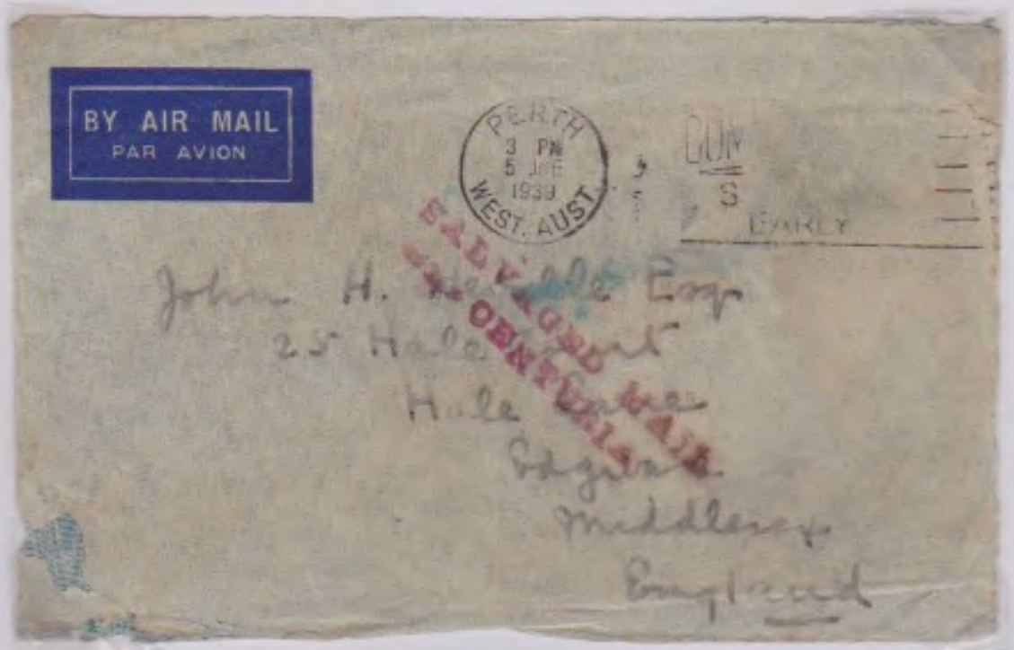
Centuria Perth 5 June 1939