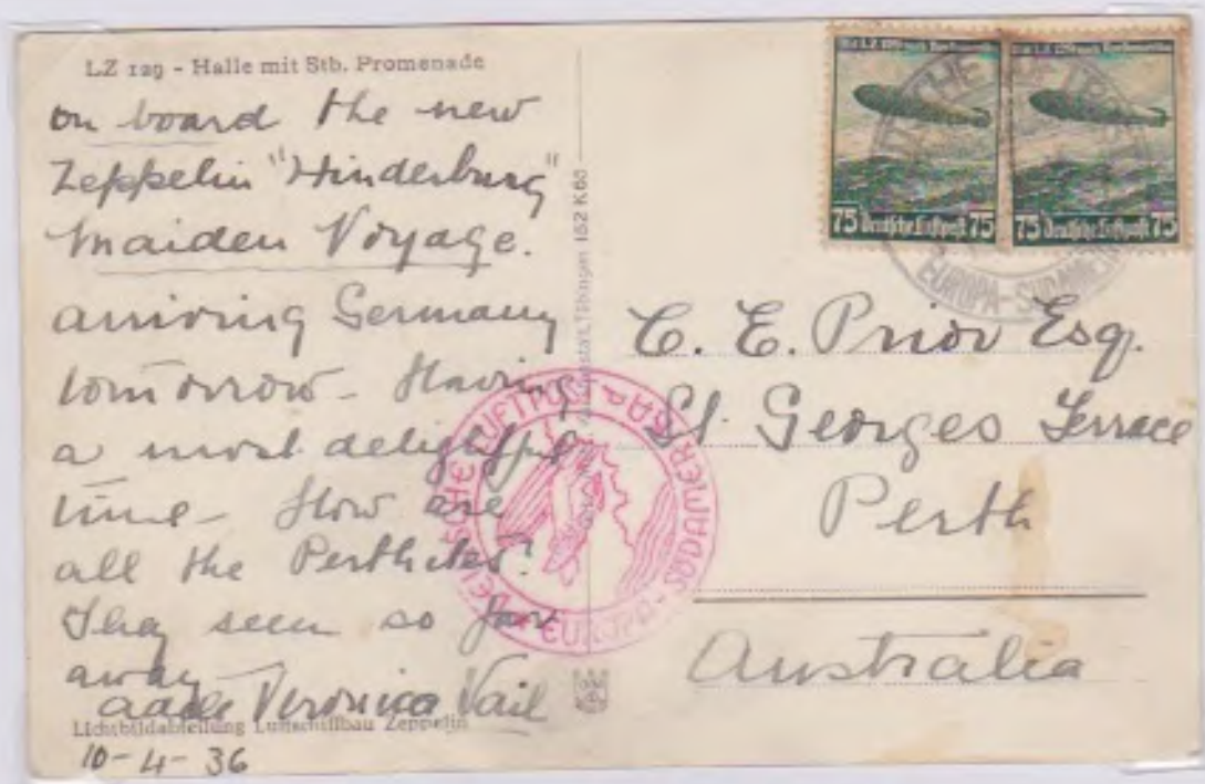
Picture postcard of starboard promenade deck of LZ 129 Hindenburg Deutsche Luftpost Europa-Sudamerika Hindenburg 10 April 1936, airship cachet

Written on board the first return flight by the Zeppelin Hindenburg from South America. Hindenburg had an engine fail over the Atlantic on the outwards voyage and another failed on the return voyage while over the Sahara. It limped back to Germany on two engines. No transit markings so it may be this card was forwarded to Paris to connect to Imperial Airways to Singapore, QANTAS to Darwin, MMA to Perth.