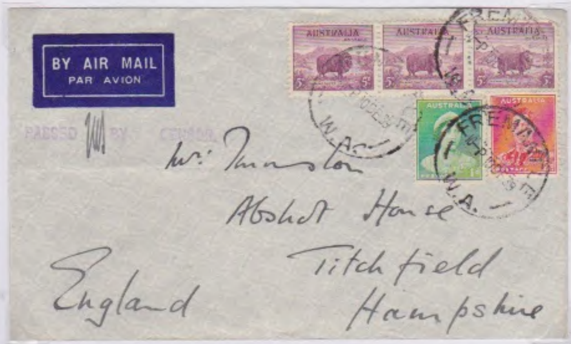
Fremantle 10 December 1939, naval censor cachet

Intending passengers, as a temporary measure, should address written communications to the company's head office, Airways House, S.W.