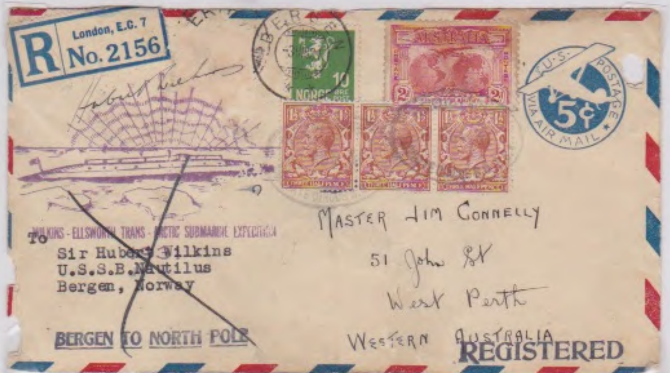
Bergen 3 August 1931, Ludgate Circus B.O. 19 October, Perth 17 November, stamp with Perth cancel removed to reveal Wilkins signature

The Australian, Sir George Hubert Wilkins expedition was funded by American financier Lincoln Ellsworth and set out in the US submarine Nautilus on 4 June 1931 to reach the North Pole underwater. Mechanical problems prevented them reaching the North pole and the Nautilus was scuttled off Bergen on 30 November 1931. Cover paid for airmail London-Karachi.